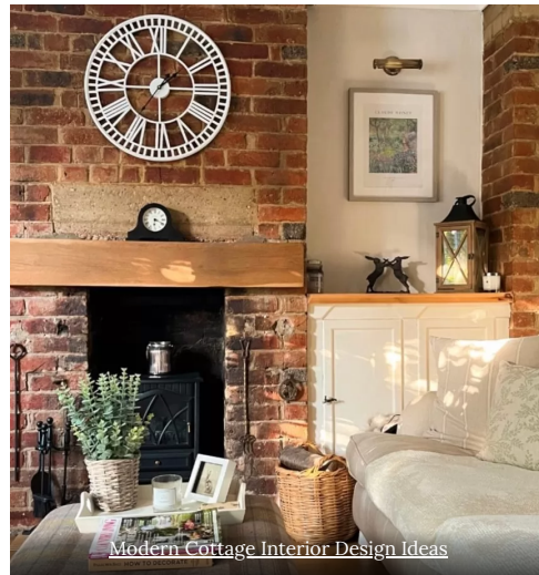
Modern Cottage Interior Design Ideas