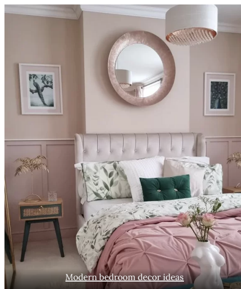
Modern bedroom decor ideas