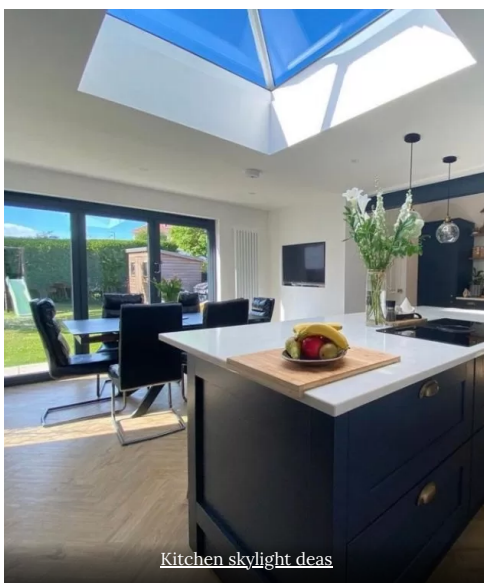
Kitchen skylight ideas